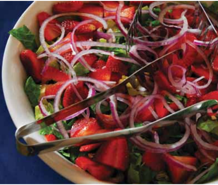
Passion for Food