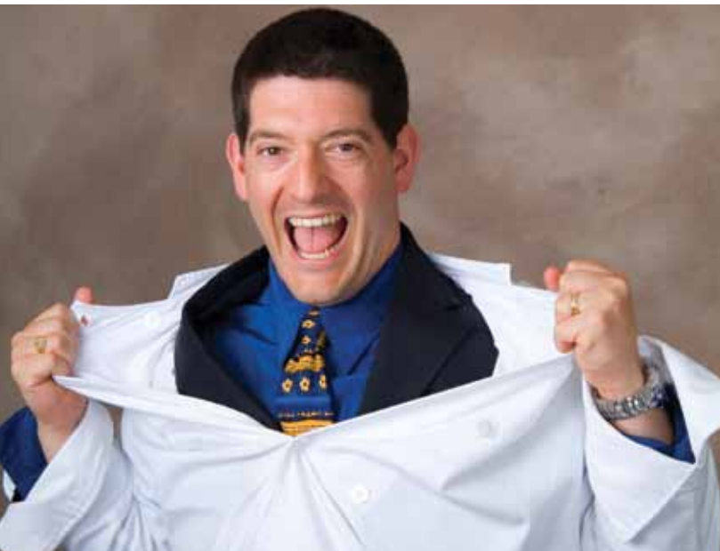
Passion for Business