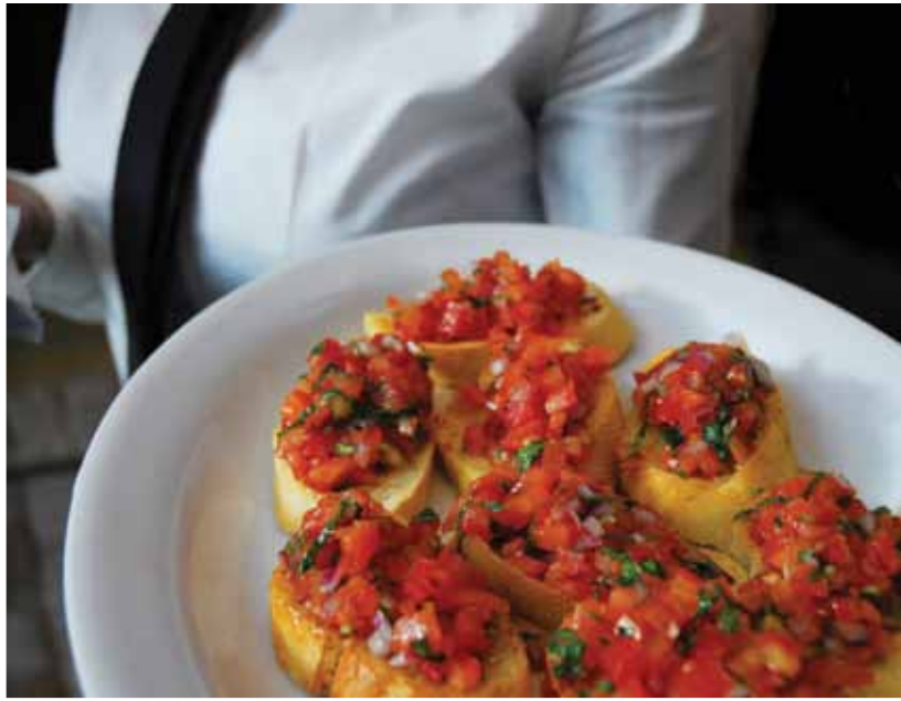
Passion for Service